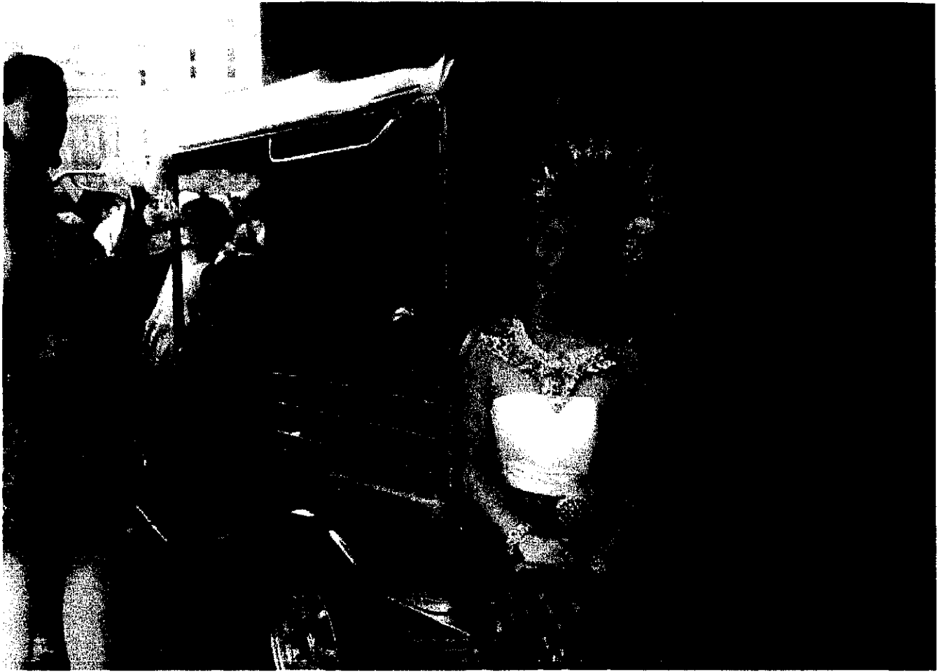
LONDON TRAFALGAR FESTIVAL