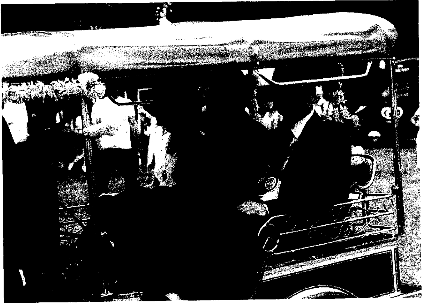
SOUTHAMPTON THAI FESTIVAL